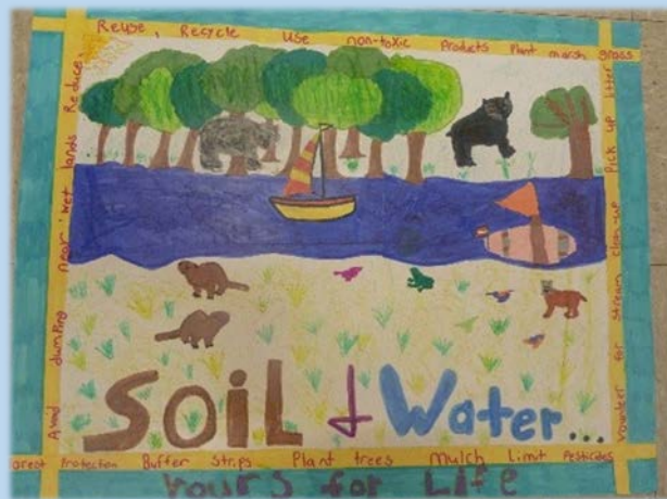
3 rd Grade Poster Contest Winner -1st Place Area IV 3 rd Grade Poster Contest Winner 2 nd Place State Callie Mooring – Rock Ridge Elementary School