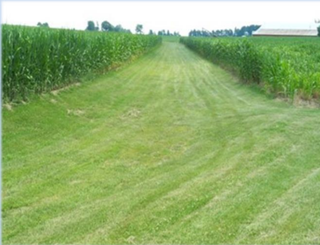
Pictured above is a grassed waterway put in place to reduced soil erosion, sedimentation and pollution.