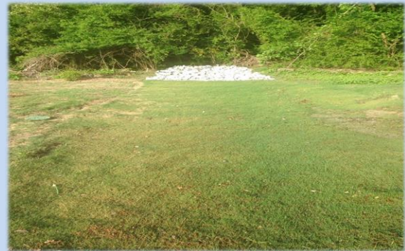
Pictured above is a grassed waterway used at the Ag center to help with storm water pollution.