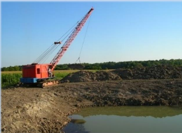
Pictured above is sediment removal to increase water storage for irrigation.