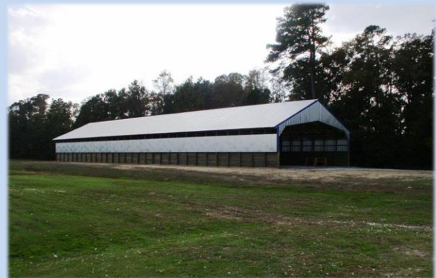
Pictured above is dry litter storage. This structure provides environmentally safe storage of litter and allows for proper timing of litter application to crops. It also stabilizes litter for pathogen and insect control.